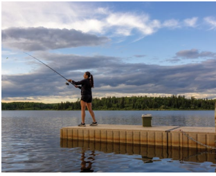
FIGURE 8 PROVINCIAL LAKE & RECREATION AREA